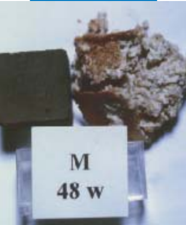
Sample of the reference mortar

Mortar sample after 336 days conditioned in H 2 O