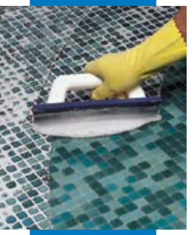
Grouting glass mosaic with Keracolor FF mixed with Fugolastic