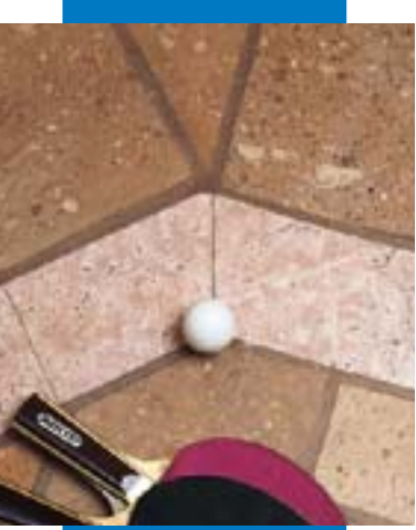
Terracotta floor polished in situ, grouted with Keracolor GG mixed with Fugolastic