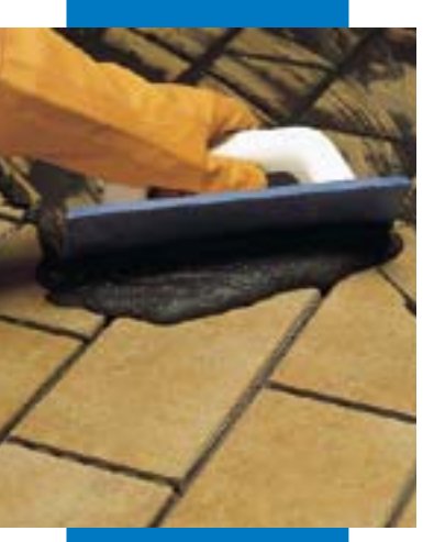
Grouting an external klinker tile floor with Keracolor GG mixed with Fugolastic