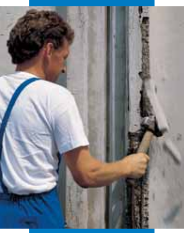
Demolition of degraded concrete