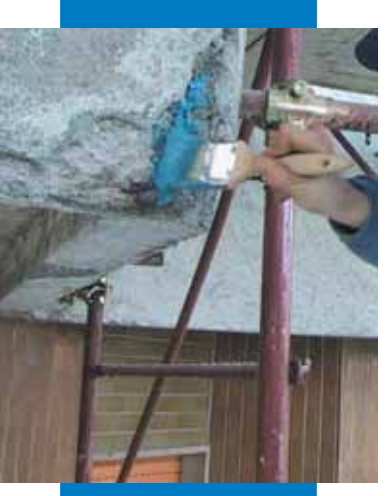
Applying Mapefer 1K with a brush on reinforcing rods of a reinforced concrete balcony