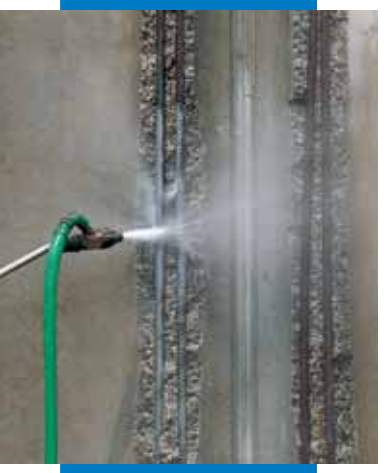
Cleaning reinforcing rods