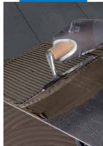
Spreading the adhesive on the back of the tile