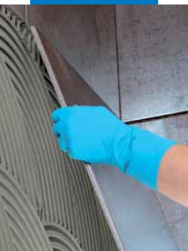
Laying large-sized tiles on walls

2) higher yield: yield is approximately 60% higher compared with conventional MAPEI cementitious adhesives.