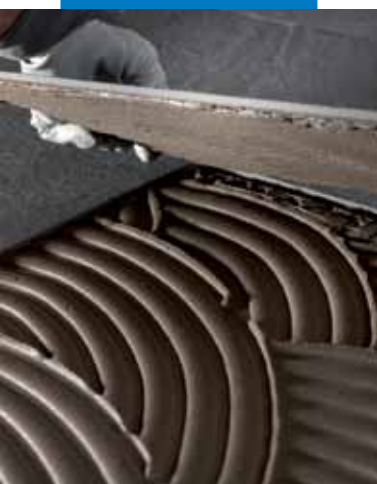
Installing thin porcelain tile on floor