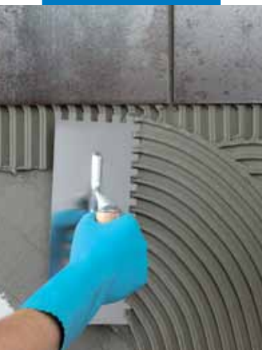
Spreading Ultralite S1 with a notched trowel on wall