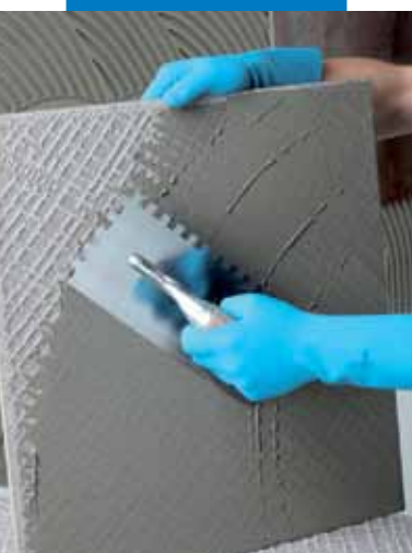
Spreading adhesive on the back of the tile