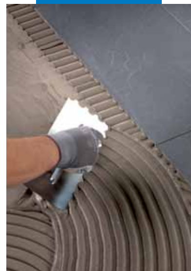
Spreading the adhesive on floor with a 9 mm round-tooth notched trowel