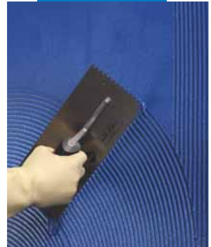
Spreading blue Kerapoxy Design used as an adhesive with notched trowel