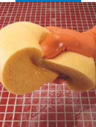
Wetting the surface of the grout before cleaning