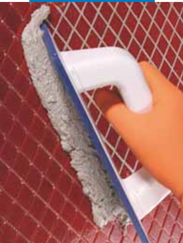
Application of Kerapoxy Design with a hard rubber grout float