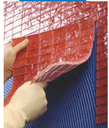
Laying glass mosaic with Kerapoxy Design on wall