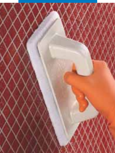
Cleaning off the glass mosaic with a damp Scotch Brite® pad