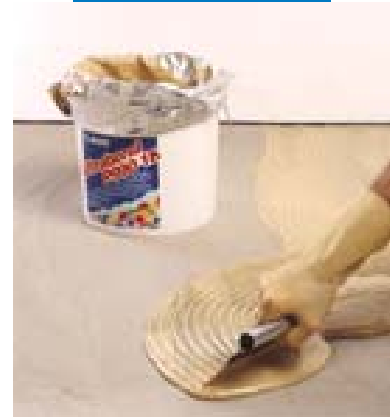
Applying the adhesive