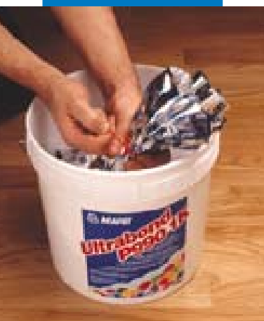
Sealing the bag