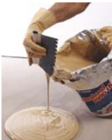
Cleaning off the adhesive from the bucket with a trowel