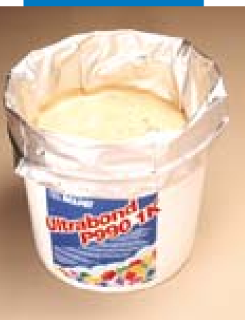
Opening the aluminium bag and folding it over the bucket