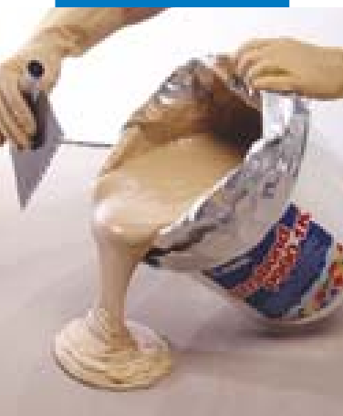
The adhesive is poured onto the screed