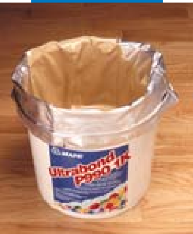
Partially used product to be stored