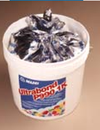
The Ultrabond P990 1K packaging

The floors can be polished after 3 days. Any residual adhesive on the floor surface can be easily removed by sandpapering.