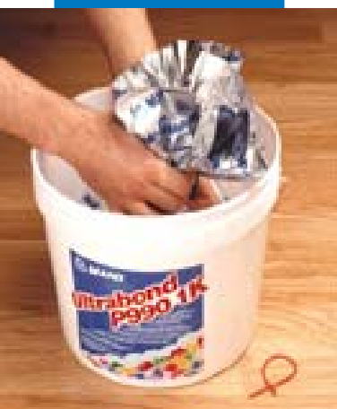
Closing the bag with the special band found in the bucket