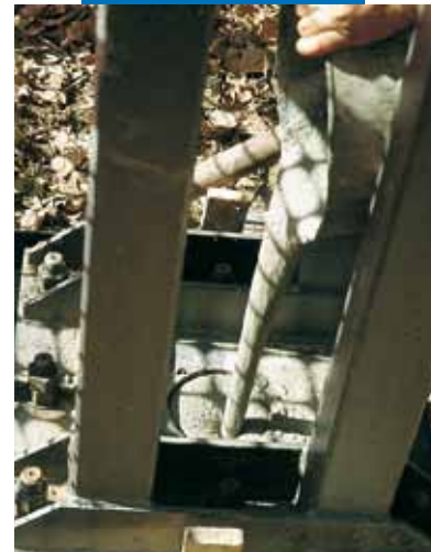
Anchoring of structural steel work with Mapecoll

All relevant references for the product are available upon request and from www.mapei.com