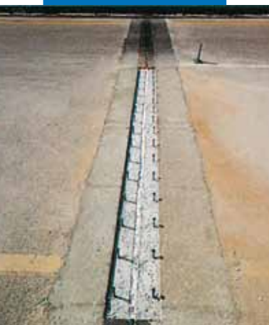
Repairing rigid joints of a highway bridge with Mapefill