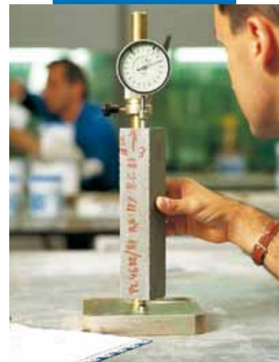
Determination of restrained expansion according to UNI 8147