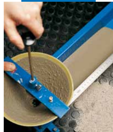
Flow test recording to UNI 13395-2