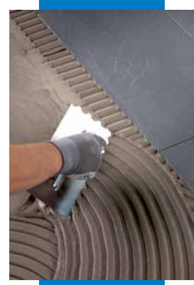
Spreading the adhesive on floor with a 9 mm round-tooth notched trowel