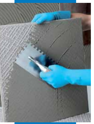
Spreading adhesive on the back of the tile