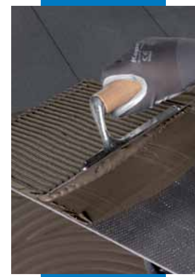
Spreading the adhesive on the back of the tile