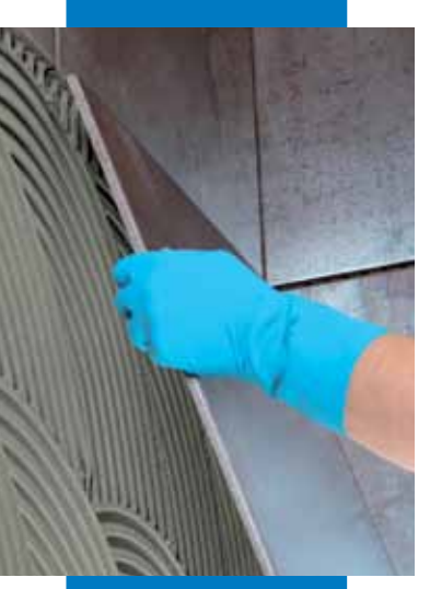
Laying large-sized tiles on walls

higher yield: yield is approximately 60% higher compared with conventional MAPEI cementitious adhesives.