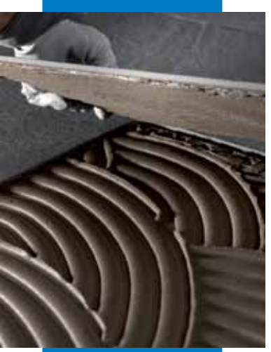
Installing thin porcelain tile on floor