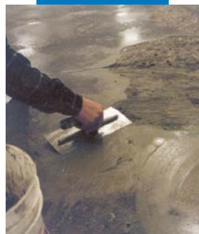
Concrete repair of industrial floor