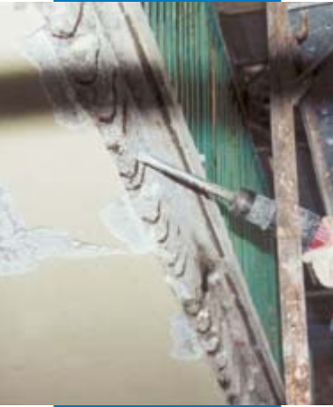
Restoring the front side of the concrete slab of a balcony: preparing the substrate