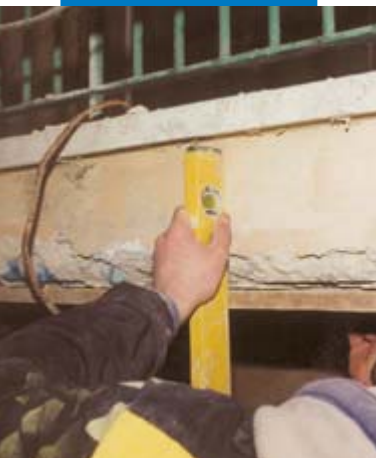
Restoring the front side of the concrete slab of a balcony: positioning wooden form work