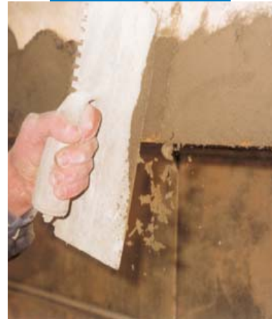
Restoring the front side of the concrete slab of a balcony: finishing