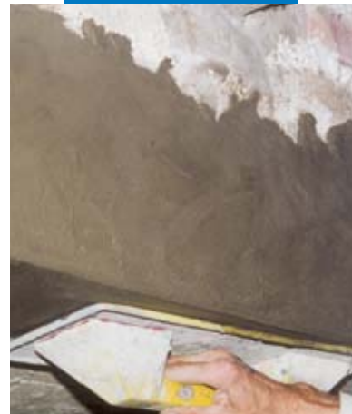
Patch-work of a concrete beam