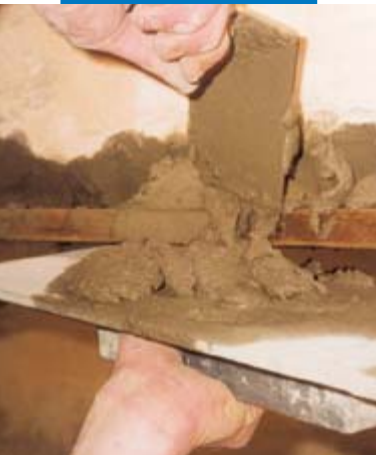
Restoring the front side of the concrete slab of a balcony: applying Planitop 400